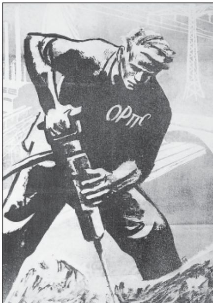
Figure 2: Boris Angueloushev's poster All-workers' trade union, 1948