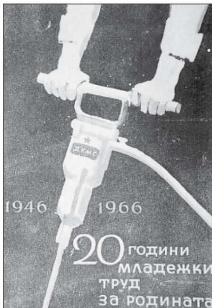
Figure 3: Boris Angueloushev's poster 20 years of youth labour for the homeland, 1966