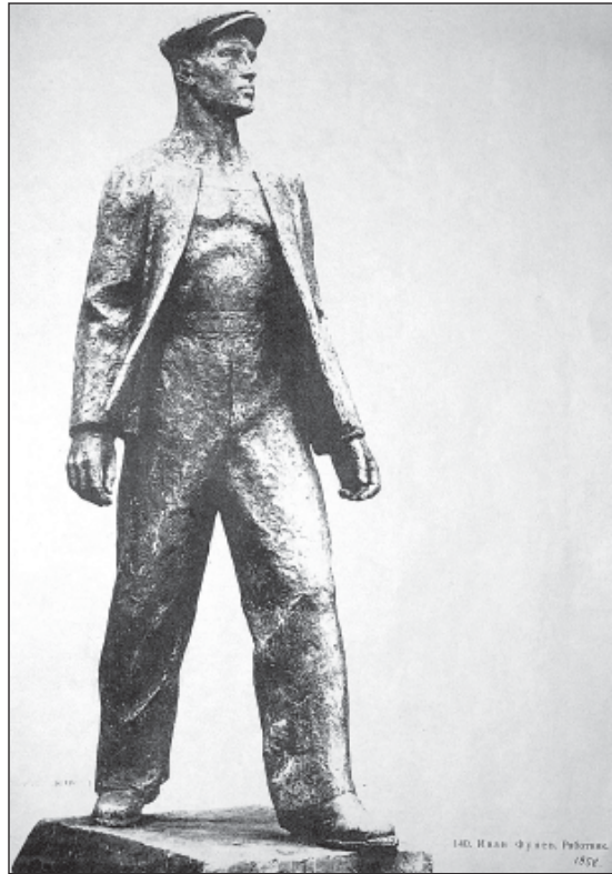
Figure 1: Ivan Founnev's sculpture Worker , 1958

Notwithstanding the spell of technology, work was defined as a core value of the new societal order primarily in political and ethical terms. Unlike capitalism, socialist ideology regarded it not as a matter of labour market but as the central merit of the individuals defining their social identity, their position in society and their existential condition. Work was the basis of the whole social order. According to the Marxist-Leninist doctrine, workers were the most progressive class in society, its leading power. The Communist Party had to be in its essence a workers' party. Its coming to power was interpreted as the workers' victory in the class struggle (see Figure 1).